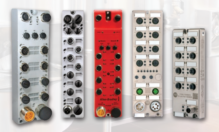
For more information on ArmorBlock I/O, visit ab.com