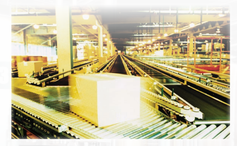
Sample application of conveying equipment in a material handling process.

ArmorBlock I/O and ArmorBlock Guard I/O blocks are best-suited for automotive, material handling and packaging applications.